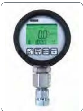
Digital pressure gauge: AVD10008 Thread: 1/4"-BSP Gauge adaptor: AZ1507